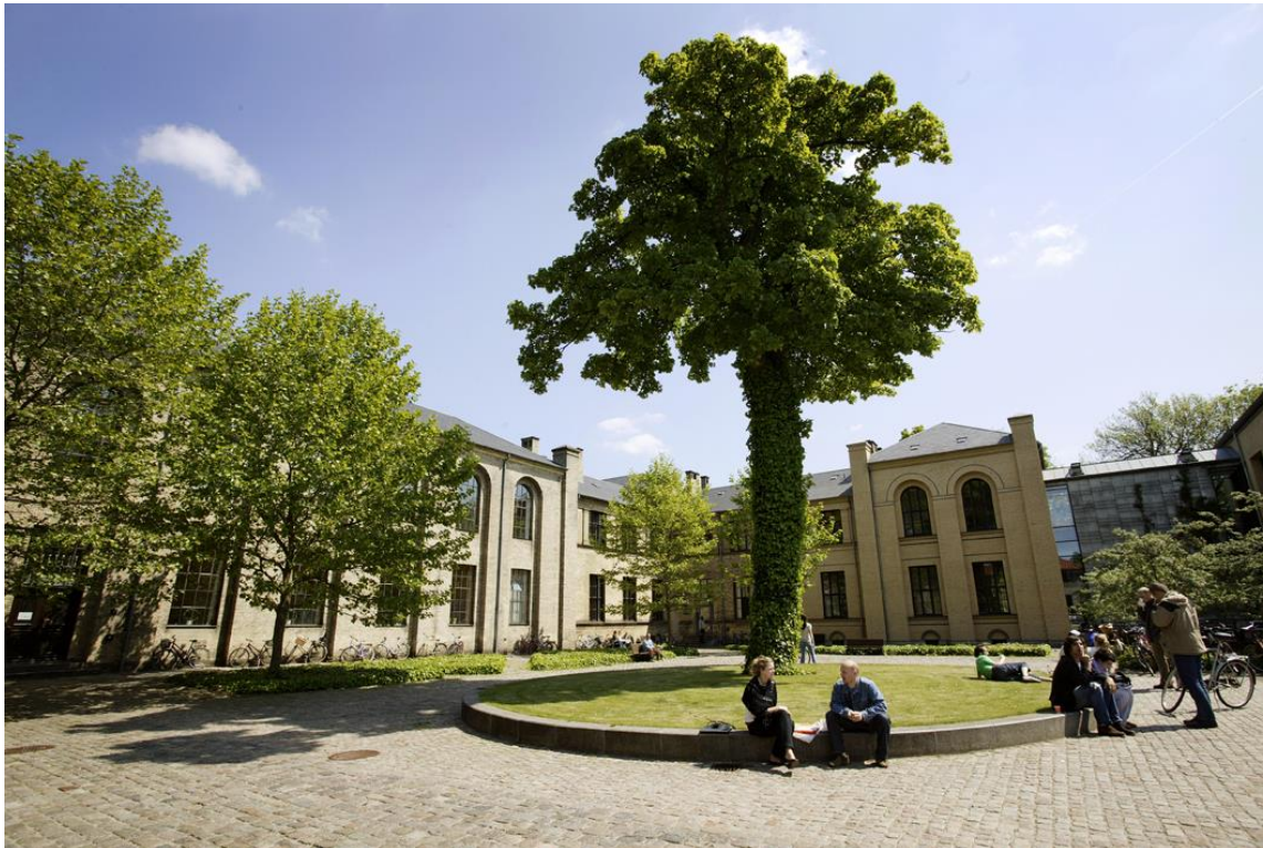
SIFC – Welcome Tutorial, 03.10.2017

University of Copenhagen, Faculty of Science (SCIENCE), Denmark